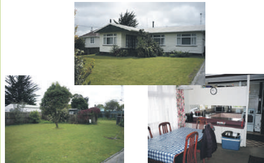
81 Alexandra Street, Marton