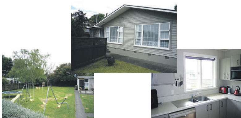
21 Calico Line, Marton