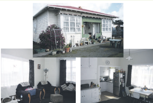
34 King Street Marton