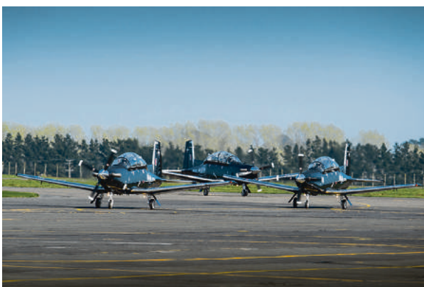
Above: Three T-6C Texan aircraft land at Base Ohakea after a training flight.

Three T-6C Texan aircraft land at Base Ohakea after a training flight (below). The first Royal New Zealand Air Force(RNZAF) pilots trained using the T-6 Texan II integrated pilot training system will graduate tomorrow and will do so under a newly consecrated squadron standard (flag). The pilots of 16/1 pilot course will receive their brevets after witnessing the consecration and presentation of a new standard for the re-established No. 14 Squadron. No. 14 Squadron was first formed in 1942 as the RNZAF's first fighter unit, deploying into several theatres, until taking up the role of advanced pilot training in 1972. It was disbanded in December 2001 and re-established with the introduction of the T-6C Texan II trainers in 2015.