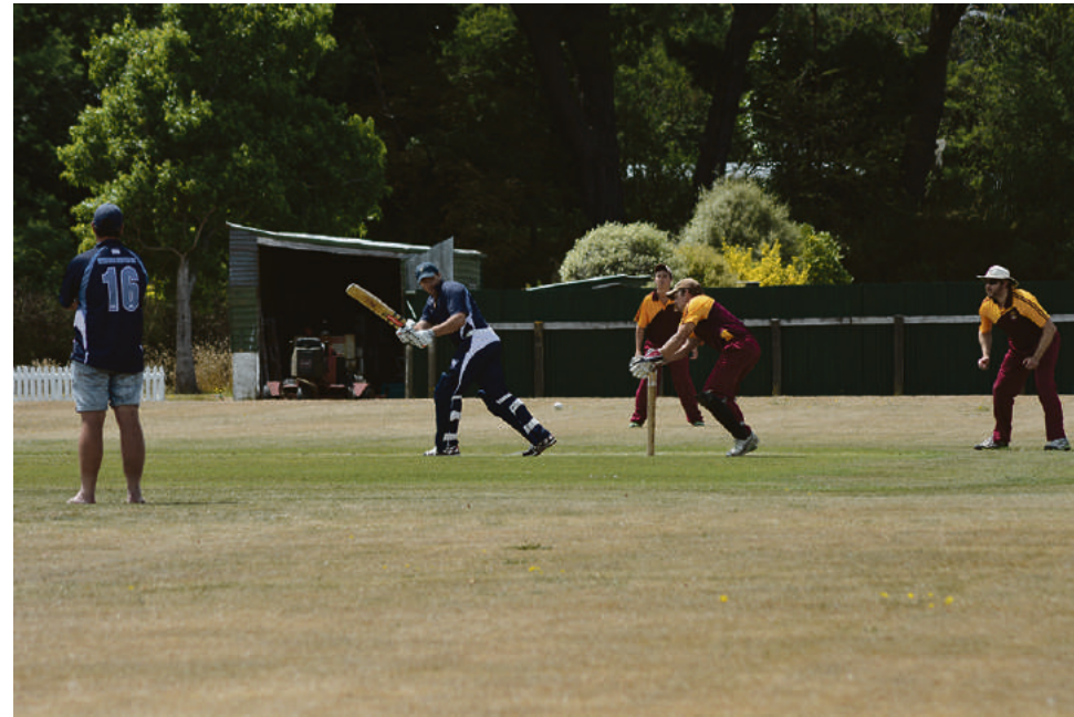
Above: Marton Saracens cricketers at their home ground of Centennial Park.