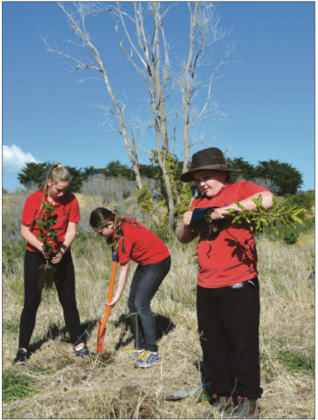
Bulls School pupils planting natives near Rangitikei River.