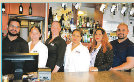
The Club Hotel team - ready for summer with great dinner and lunch menus.