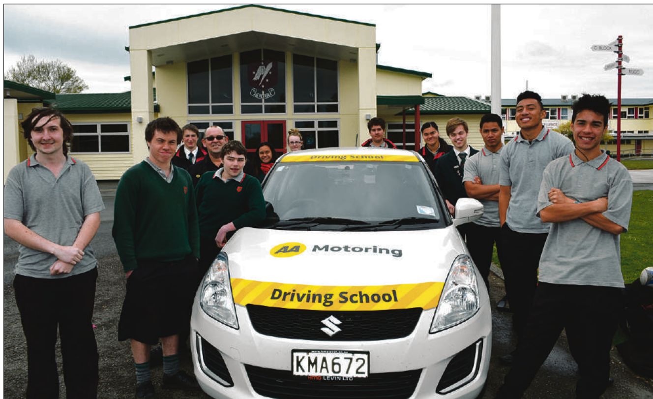
Rangitikei College students are benefiting from a Marton Lions Club initiative to provide driving support and driving lessons at the college for free.