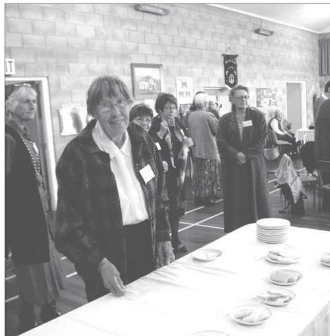
Tutaenui Rural Women regularly hold their meetings and functions in the Tutaenui Hall, like this anniversary party in 2013.