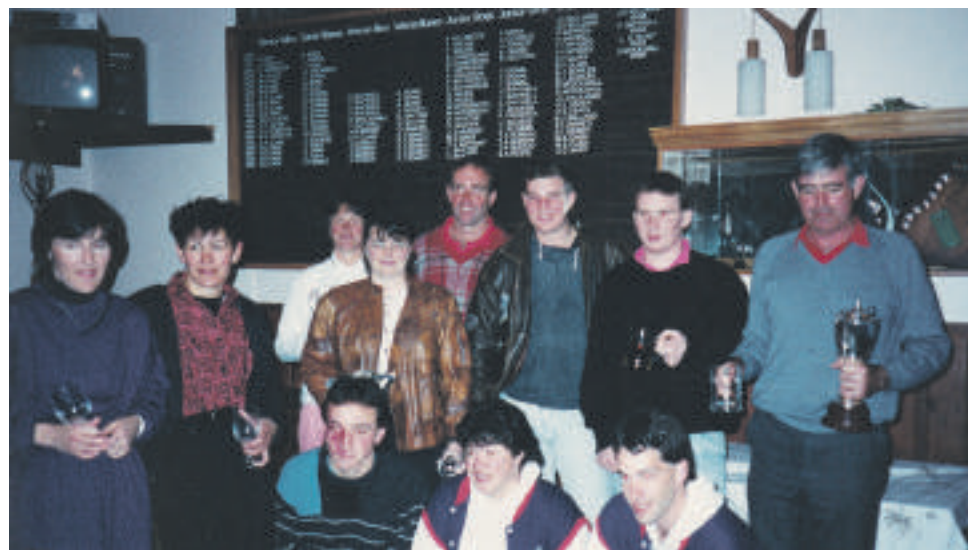
Above: a photo of 1990 championship winners from Rangitikei Squash Club files. The club celebrates its golden jubilee in April.

The club is celebrating its 50th anniversary at Easter this year. Former squash players from the Marton club are invited to register and join the gathering of old friends and competitors between Friday 19 and Sunday 21 April. To register, you can pick up a form from One Stop Stationery & Books in Marton, 237 Broadway, Marton. Also, you'll find information on Facebook, or at www.rangitikeisquash50years.weebly.com