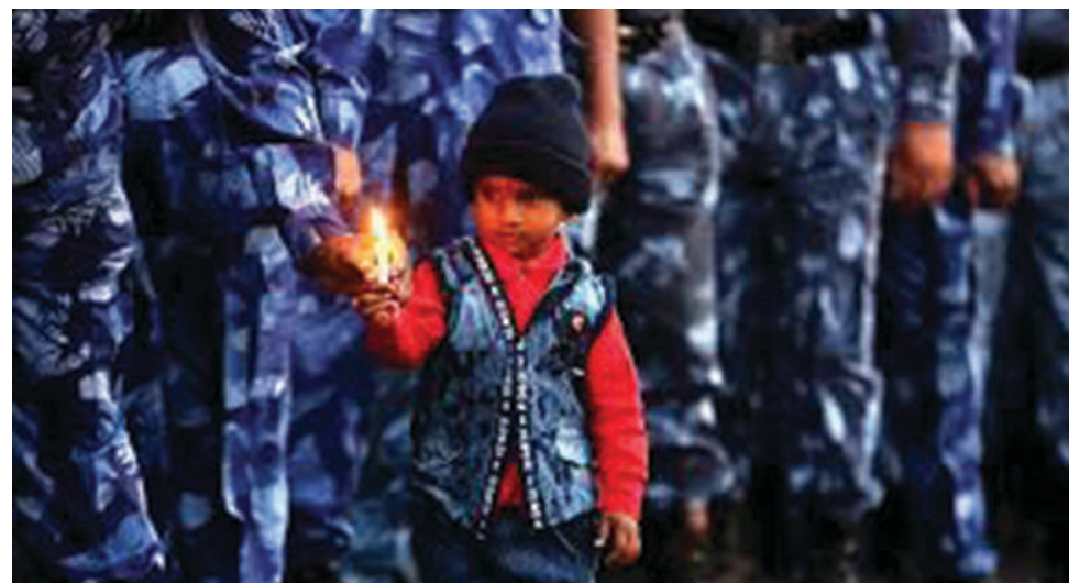
A child of one of those killed holds a candle at his father's funeral

Vijay is asking people to pray for the souls of those killed, so they may rest in peace.